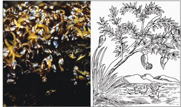
Figure 2 Barnacles as early stages in the life cycle of geese. Left: goose barnacles attached to a drifting log. Right: medieval view of the 'goose tree' producing geese of the genus Branta from barnacles.

Barnacles, and this is true for Cirripedia and their kin in general, are one of those groups whose phylogenetic position has only been resolved by the recognition of their life cycle. The details of cirripede ontogeny were for a long time entirely unknown, although some speculations existed, the most curious of which was that barnacles represented early ontogenetic stages of geese, probably the Brent Goose